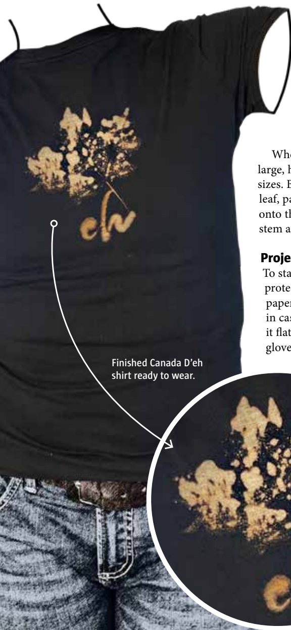
Finished Canada D'eh shirt ready to wear.

In this project I share a fun twist on traditional tie-dyeing. Typically when tie-dyeing you use a white garment, such as a shirt, sheet or sweater knotted with rubber bands and dipped in vibrant coloured fabric dyes. However, we are swapping the white fabric with dark and using bleach and maple leaves to make a one-of-a-kind, negative impression.